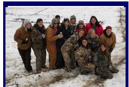
Baby Camo Weekend at Pleasant Hill!