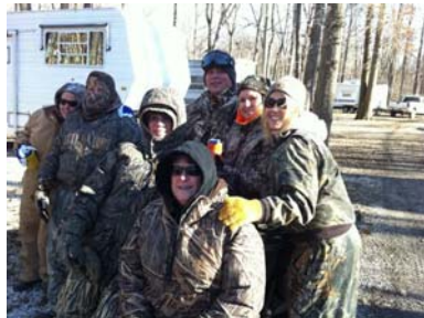
Getting ready for the first ride of the New Year.....It was COLD!

Please Note: All trailer pad fees should have been paid in full by December 31, 2010. Any unpaid fees are subject to loss of trailer spot.