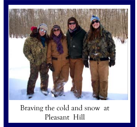
Braving the cold and snow at Pleasant Hill